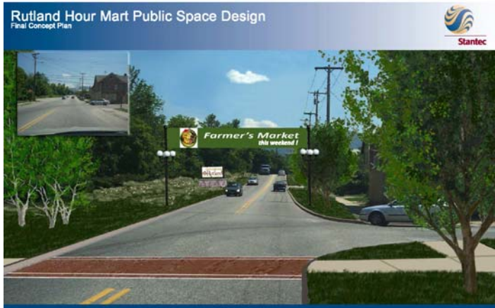
Final conceptual design for pocket park on West Street

A Corrective Action Plan (CAP) has been completed for the former HourMart on West Street in Rutland City. This is the final phase of assessment work necessary before site redevelopment begins. The CAP details how contamination at the site will be remediated before future redevelopment commences.