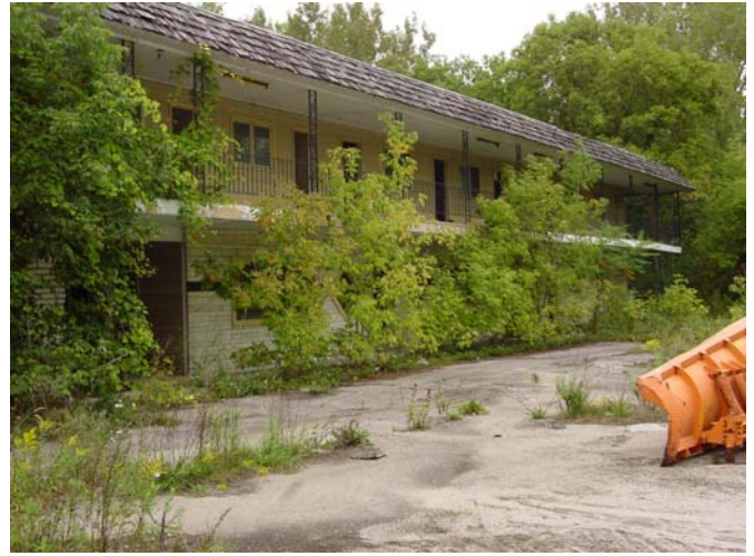
Former motel building at Flory Property in Center Rutland

The Johnson Company has been contracted to perform the ESA. The Rutland Economic Development Corporation (REDC) has facilitated the process between the landowner and the Brownfields Program.