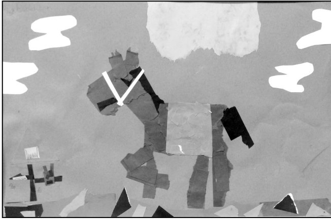
Collage by Rebecca Churchill, Grade 3