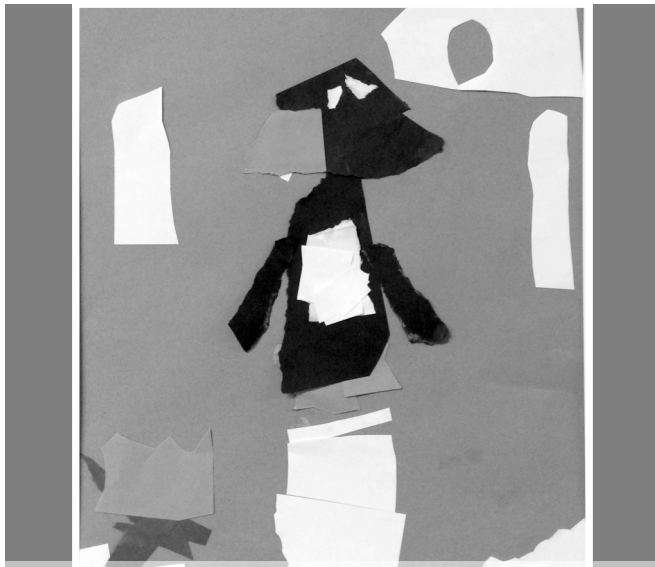
Penguin Collage By Julia Labate, Grade 3