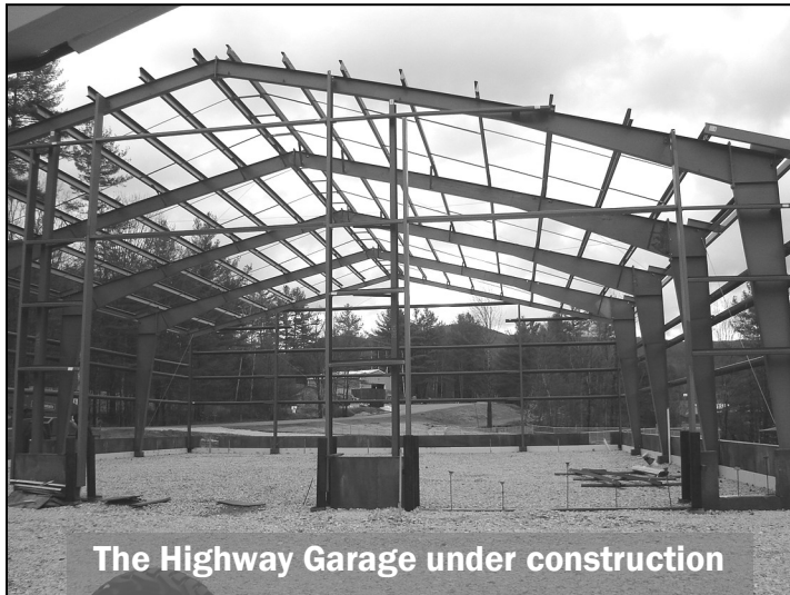
The Highway Garage under construction