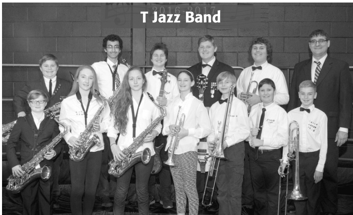
T Jazz Band

On Sunday May 21 both M and T Jazz groups will be playing the Sunday brunch at The Foundry in Killington from 11 - 1:00. Come have brunch and support our music program fundraiser. Please call The Foundry at 422-5335 to reserve your table .