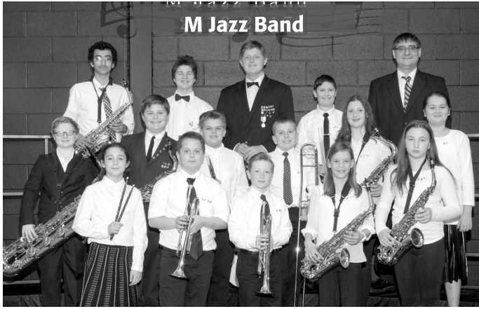
M Jazz Band