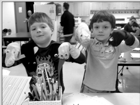
Happy kids at work and play in the Tapestry Program