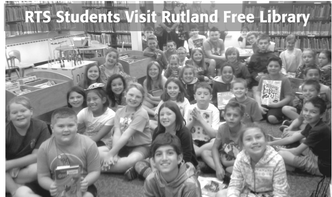
RTS Students Visit Rutland Free Library

Have a good, safe summer. This fall I will report on the progress being made toward construction of a new road connecting Holiday Drive to Cold River Road.