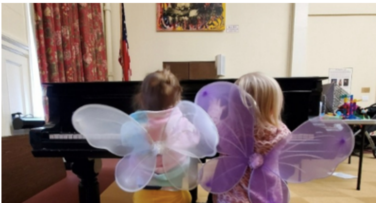
Two kiddos trying out the piano in the Fox Room at a recent Wednesday playgroup at the library.

And usage is up in the town! Our town cardholders went from just under 1,300 to 1,438 in 2022, an increase of 10-plus percent. We're delighted to welcome so many new members. To sign up for yourself or a family member, please see our website at www.rutlandfree.org , and look for the "Join" tab.