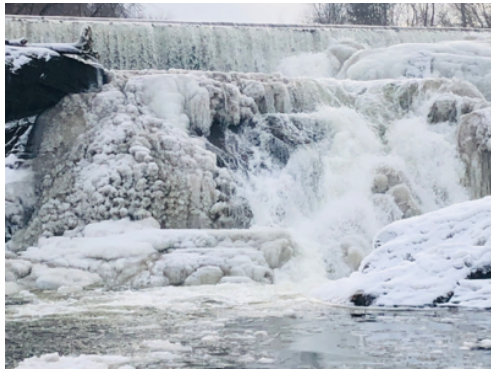
A recent photo of Pocket Park Falls - taken on the coldest day of the year!