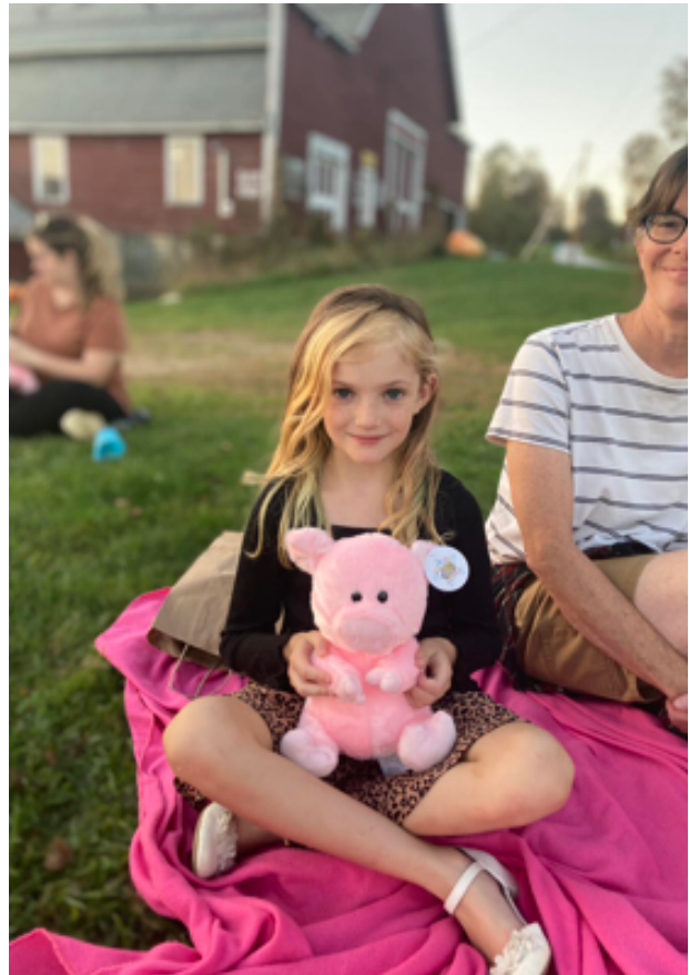
The library's stuffed animal program about pigs was so popular that they had to offer it for three nights instead of the one planned!