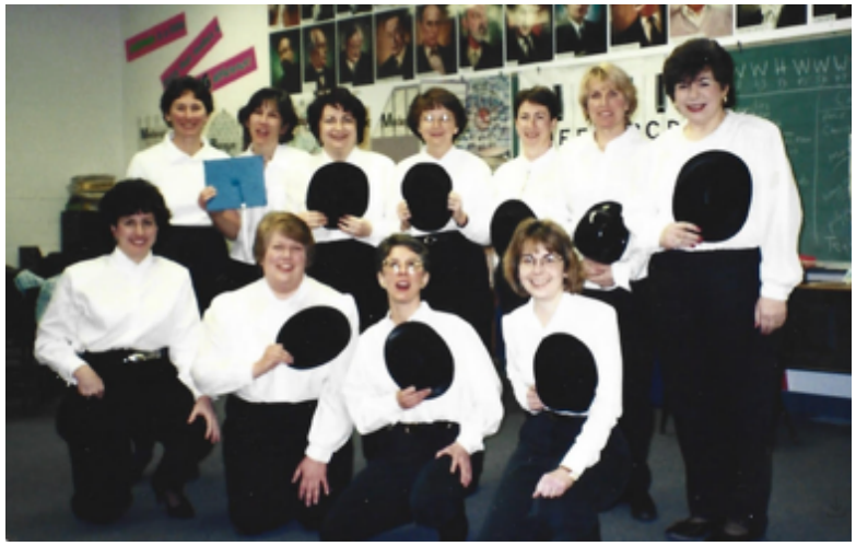
Year 2000 Teacher Act in the Talent Show song New York, New York

Another opportunity to build school pride is the Annual Student Talent Show. In 2000, the dance was