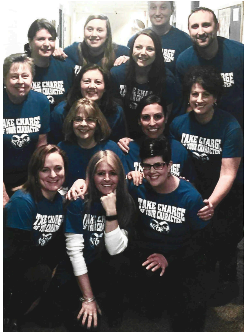
Year 2015 Teacher Act in Talent Show Song Uptown Funk