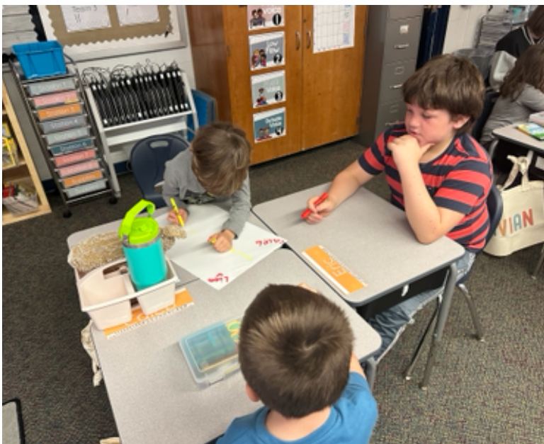
Pictured above and below: RTS 5th and 6th Grade students work with 1st Grade Little Buddies.