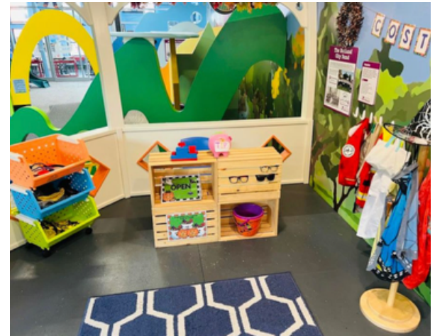
Above: Come to Wonderfeet to work, play, and dress up in our gazebo costume shop!