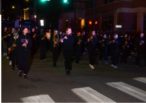
The Rutland Town Band marching in the 2025 Halloween Parade!