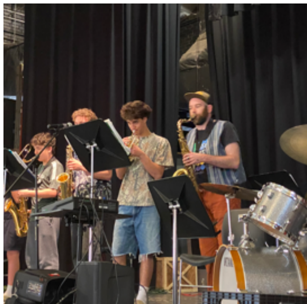
In April students from RTS and West Rutland School performed at the annual Senior Luncheon held at the West Rutland Town Hall. This longstanding event brings together community across generations.