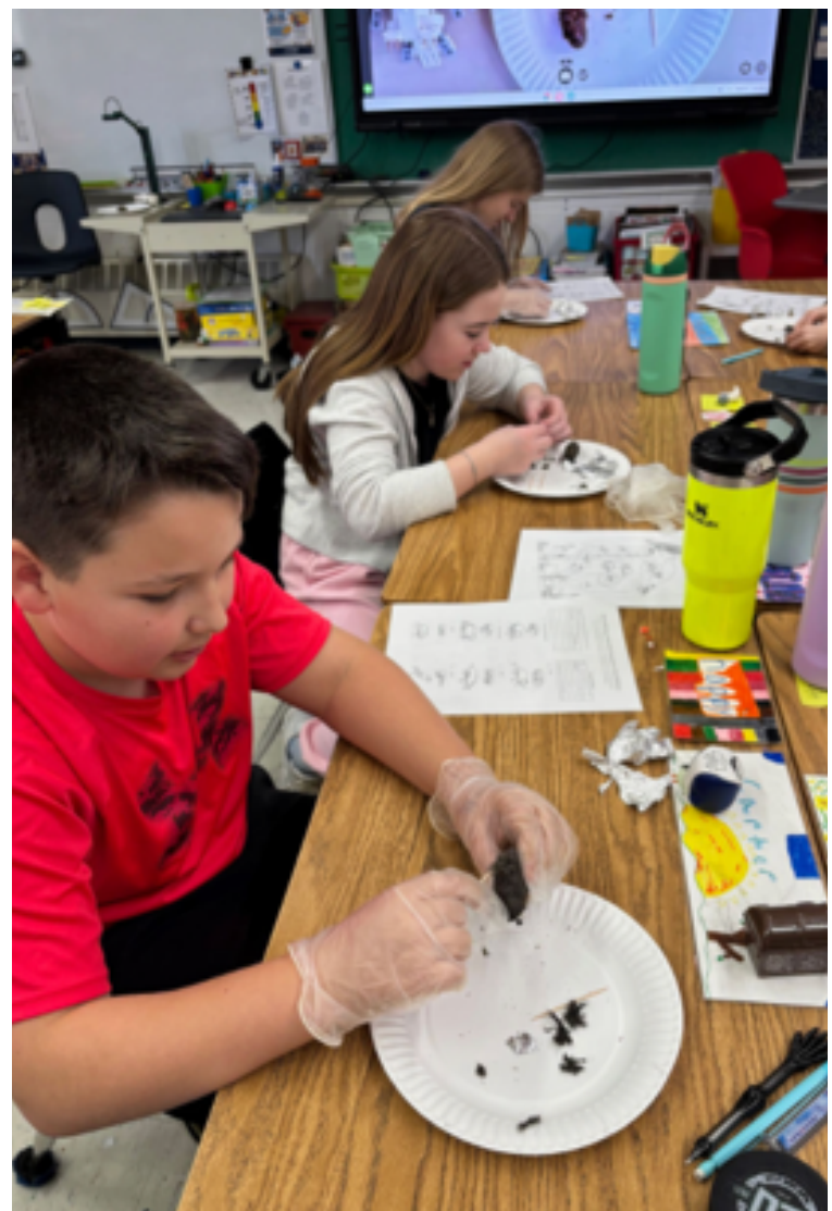
Photo credit: RTS Students in 4th grade got to dissect owl pellets during science!